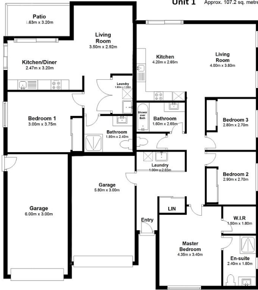
Unit 1 Approx. 107.2 sq. metres